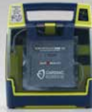
G3 Plus Automatic