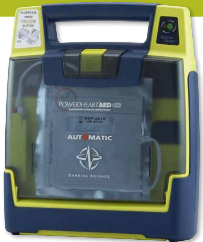
The Powerheart AED G3 Plus Automatic

Cardiac Science Corporation • 3303 Monte Villa Parkway, Bothell, WA 98021 USA • 425.402.2000 • US toll-free 800.426.0337 • Fax: 425.402.2001 • care@cardiacscience.com